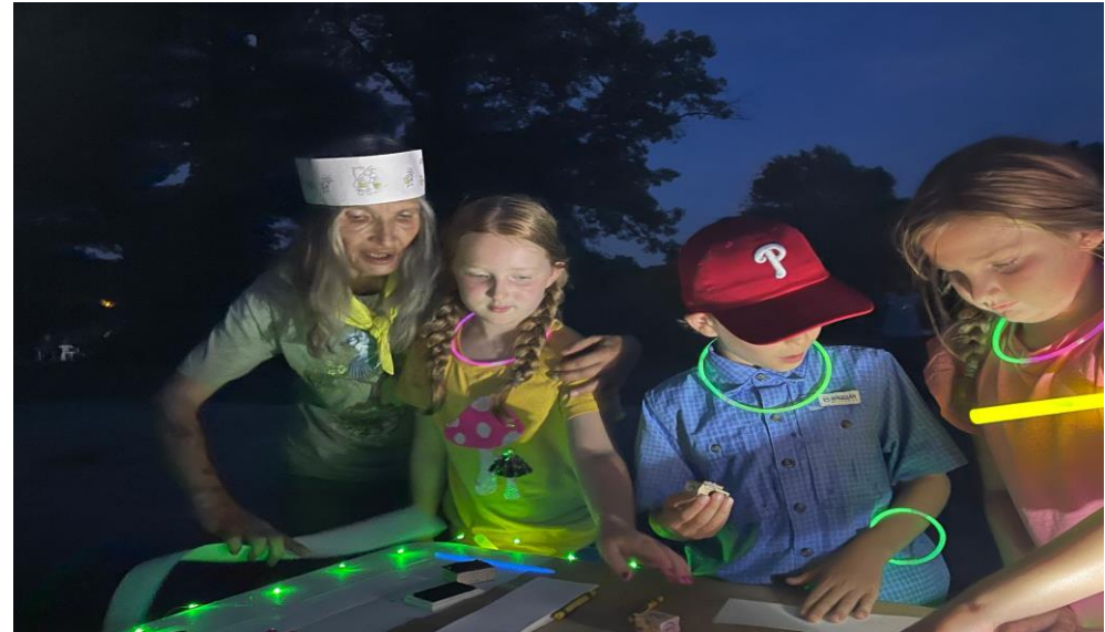
Firefly Festival Fun