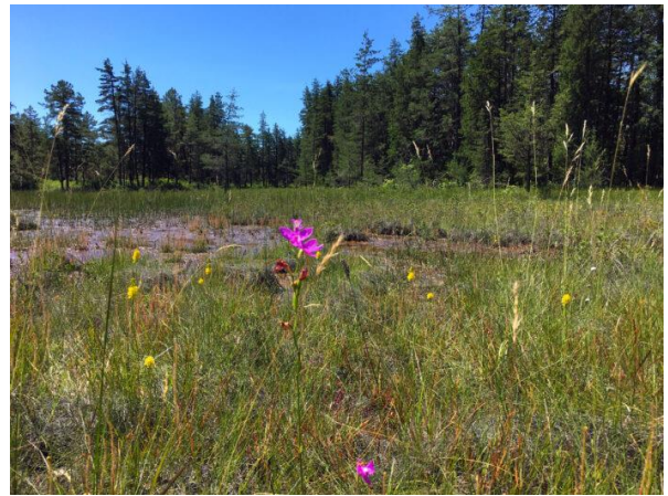
A savanna along the Batsto River