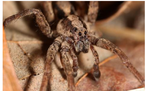
Drumming Sword Wolf Spider on dry leaves.

Monthly Summaries of BYEC findings can be found on the BYEC webpage on the GCNC website.