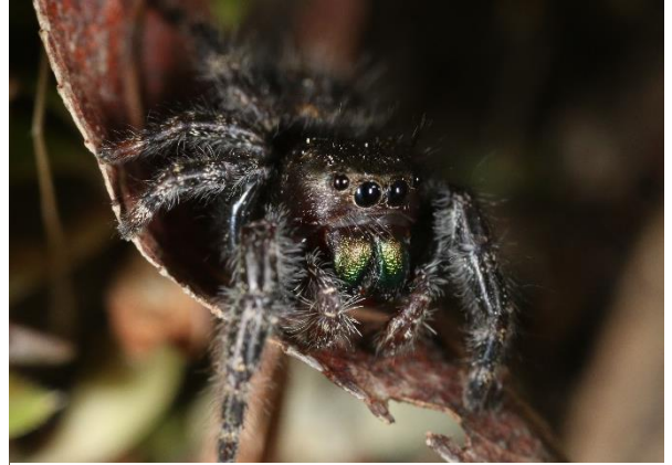
Bold Jumping Spider