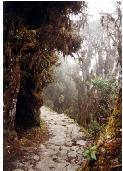
The Inca Trail

Directions: The Holy Nativity Lutheran Church is located just off Rt. 553 (Woodbury Glassboro Rd.) immediately south of the traffic light at Mantua Ave. The church parking lot can be accessed by entrances on either Woodbury-Glassboro Road or Lenape Trail (first left off of Mantua Ave).